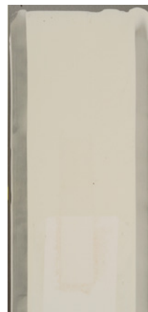
Figure 3 demonstrates resistance to asphalt bleed-through. The panel is coated with a styrene acrylic basecoat and a topcoat based on Kynar Aquatec® FMA-12 Latex, which provides significant improvement in bleed-through resistance.